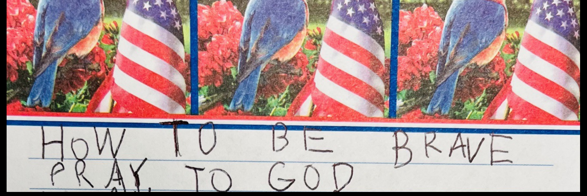
Acts 4:24–31; Neh 6:9