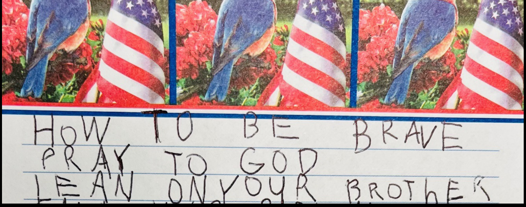
Prov 17:17; Eccl 4:9–10; 1 Thess 4:18; 5:11