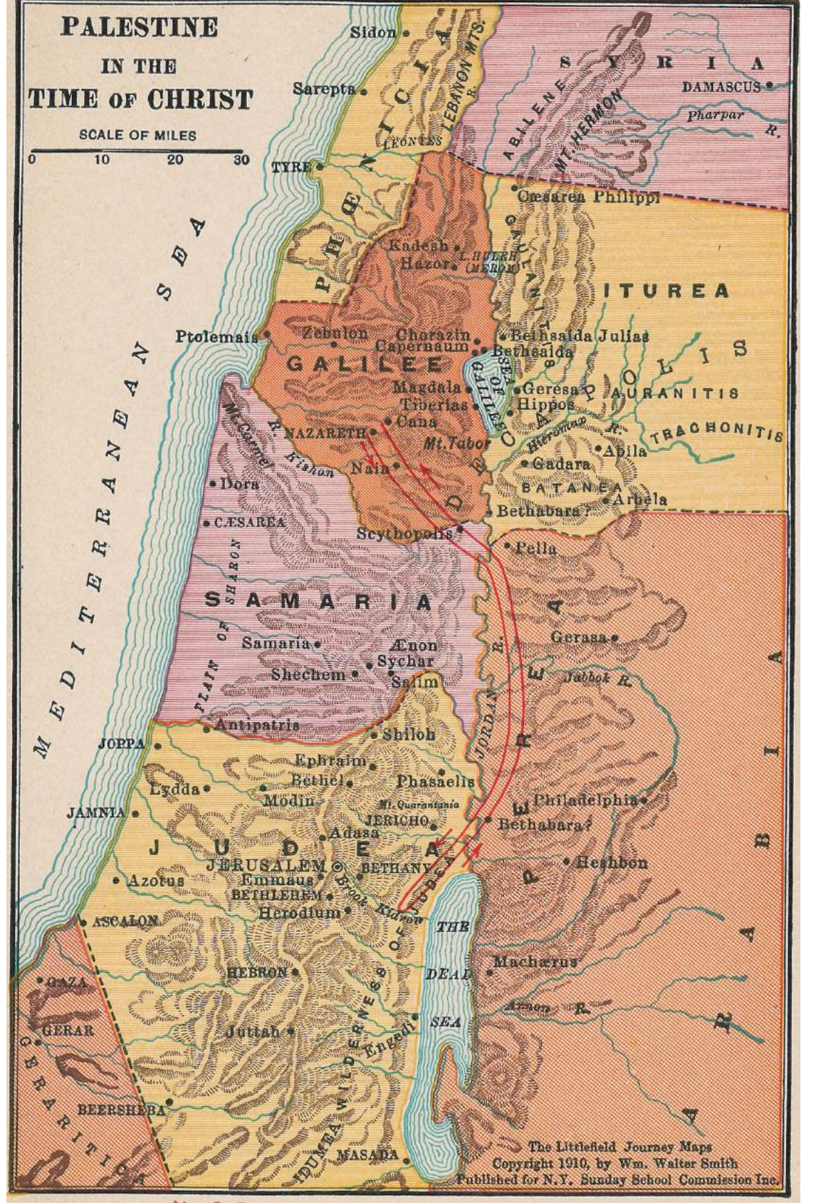
No. 2. The Opening Events of Christ's Life.