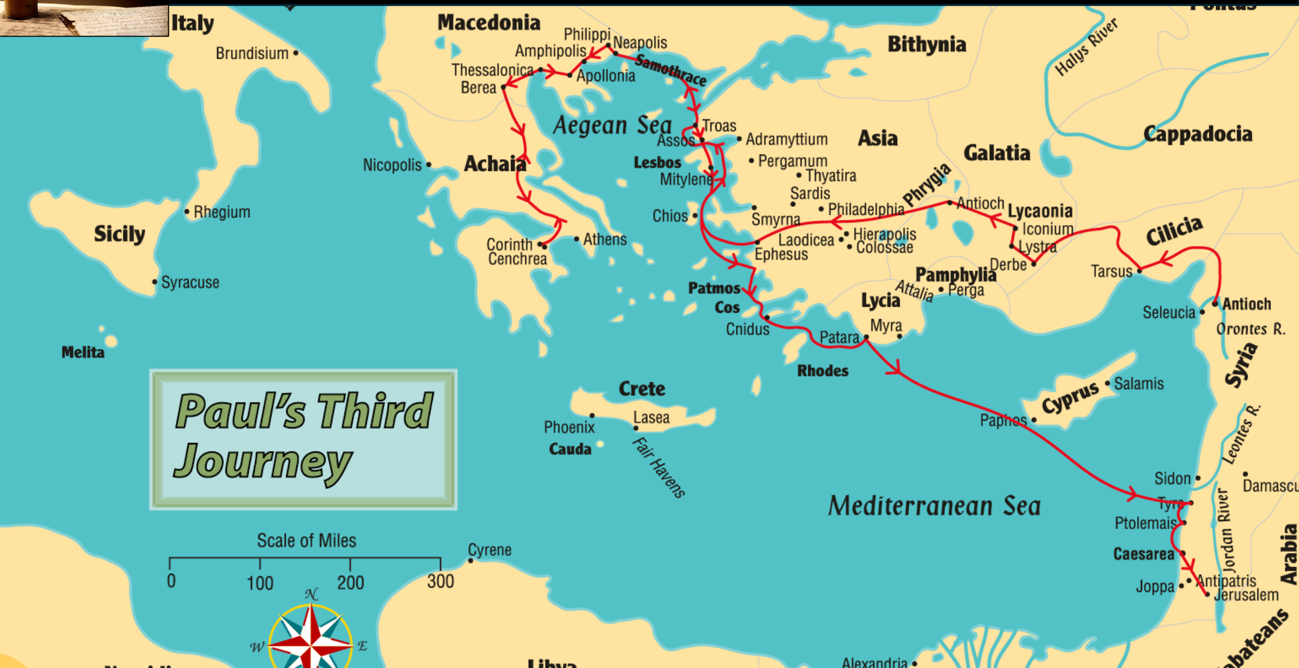
Paul's Third Journey